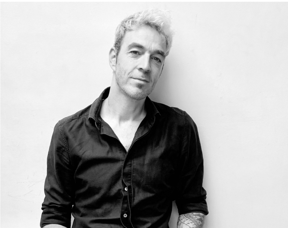
Diogo Pimentão © Diogo Pimentão

By altering perceptions of materiality and space, his works invite viewers to reconsider their surroundings, evolving their understanding of depth, weight, and structure through the act of looking and moving within the exhibition space.