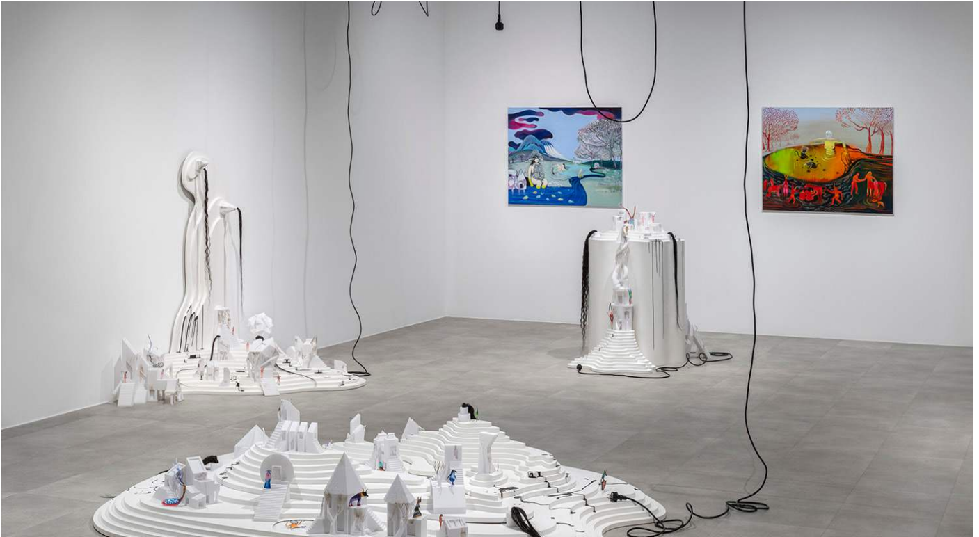
Exhibition's view of Haroum , Erika Hedayat, from October 17 th , 2025, to January 4 th , 2026

Founded by Christine Phal in 2017 on a philanthropic model, the Drawing Lab is a space for experimentation and private exhibitions entirely dedicated to promoting contemporary drawing.