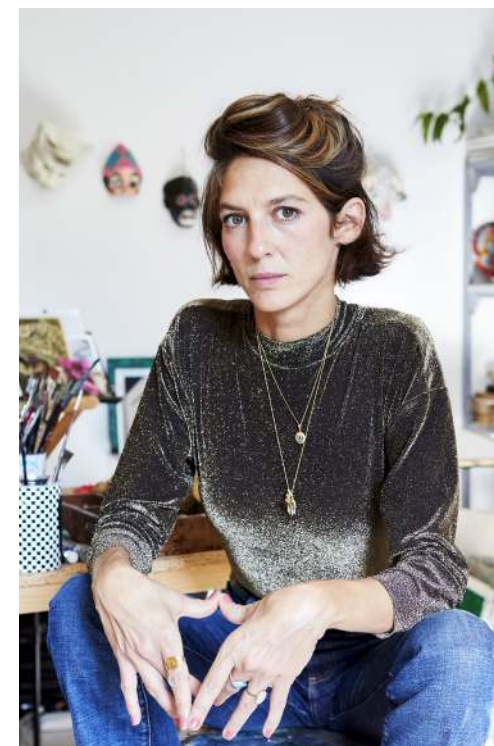
Portrait of the artist

Born in 1982, lives and works in Marseille. Represented by Espace à vendre gallery in Nice since 2005.