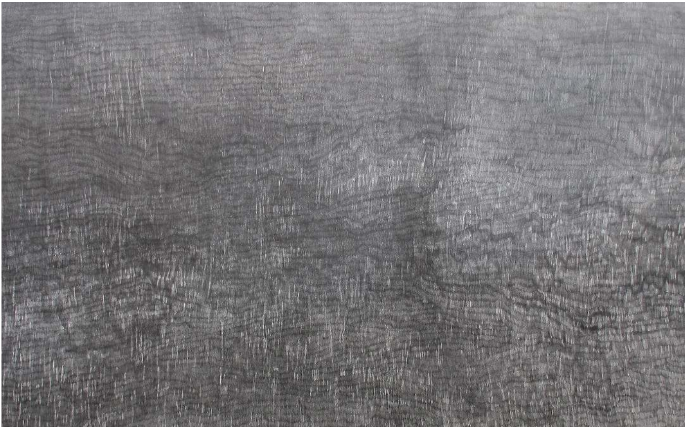
François Réau, Mesurer le temps (Measuring Time) , 2017. Lead pencil and graphite on paper mounted on canvas, 238 x 332 cm. Collection: FRAC Alsace, France © François Réau.