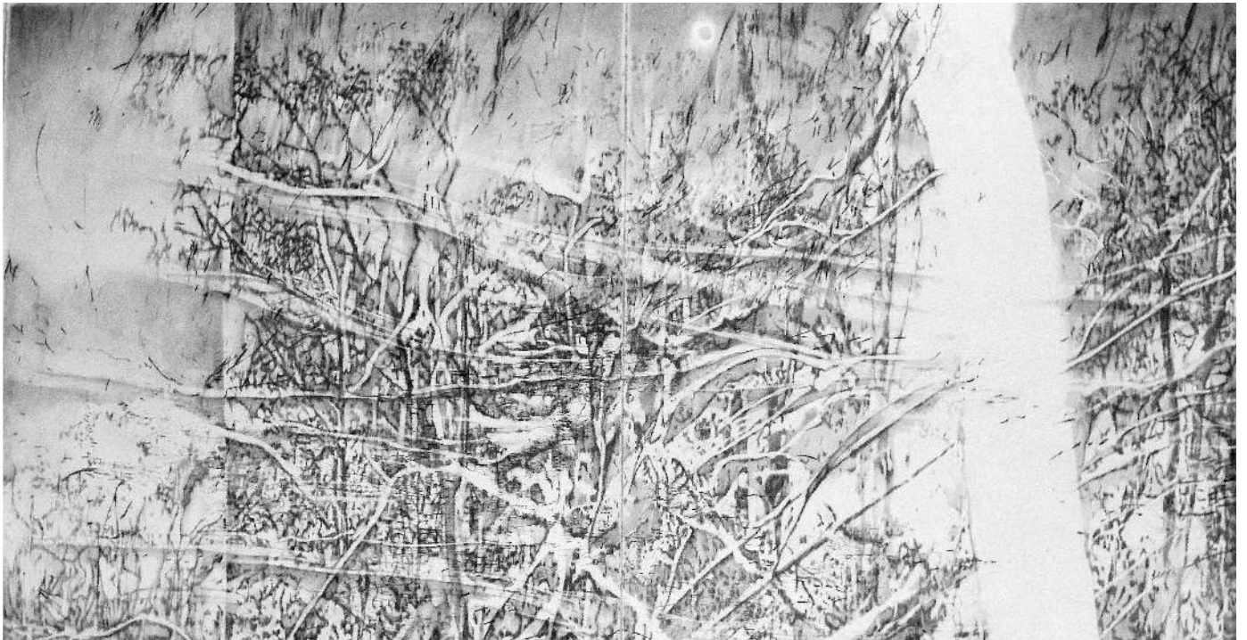
François Réau, On ne possède éternellement que ce qu'on a perdu (You can only forever keep what has been lost), 2020. Lead pencil and graphite on paper mounted on canvas, 162 x 228 cm. © François Réau

That is the starting point of Du Temps sois la mesure . A handful of strokes and dots whose intention extends beyond what we can see: a more extensive pictorial projection, a measure of space and time.