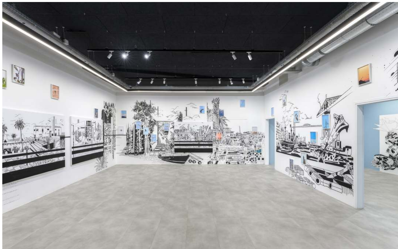
View of the exhibition I See a Bird / Je vois un oiseau , Chourourk Hriech, curated by Jérôme Sans, 18 th March - 15 th June 2022, Production Drawing Lab

In 2021, the Drawing Lab, in collaboration with the National Center for the Visual Arts, organized and accompanied 33 young drawing artists for a unique six-month residency (in a former Parisian hotel) called the Drawing Factory.