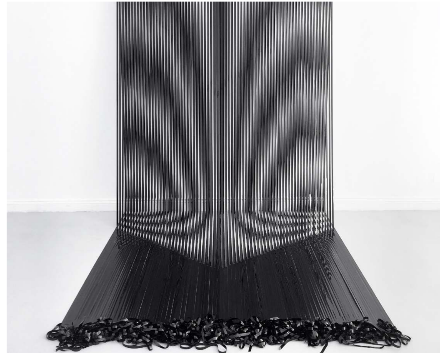
Variations on Line n10 , 2019. Spatial drawing, VHS magnetic tape, variable dimensions. Exhibition view at XcHuA Gallery, Berlin

The art center, located in the basement of the Drawing Hotel, is open to the public every day from 11 am to 7pm free of charge.